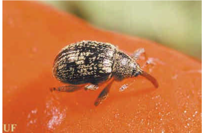
Figure 1 and 2: Adult pepper weevil